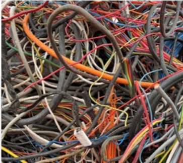
Cable n° 2