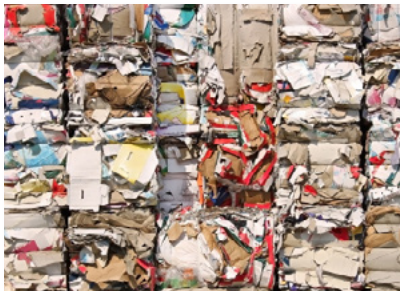
PAPER / CARBOARD