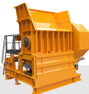
BDR 2400 U