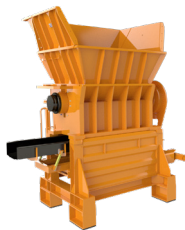
BDD 1700 H